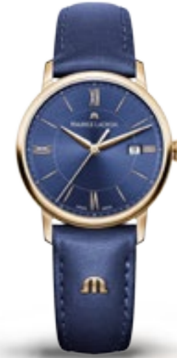
DATE LADIES EL1094-PVP01-411-1

Quartz movement Ø 30mm stainless steel case Diamond-set dial