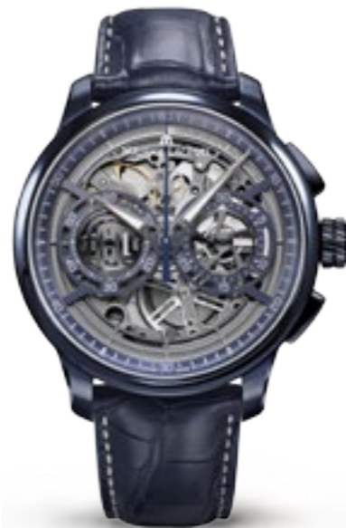
CHRONOGRAPH SKELETON MP6028-PVC01-002-1

Automatic movement ML206 Ø 45 mm blue PVD case Limited edition of 100 pieces