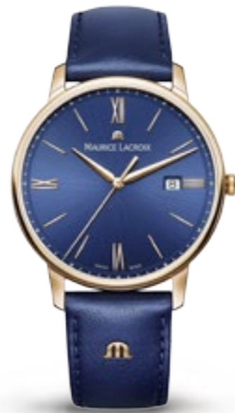
DATE EL1118-PVP01-411-1 Quartz movement Ø 40 mm 4N PVD case