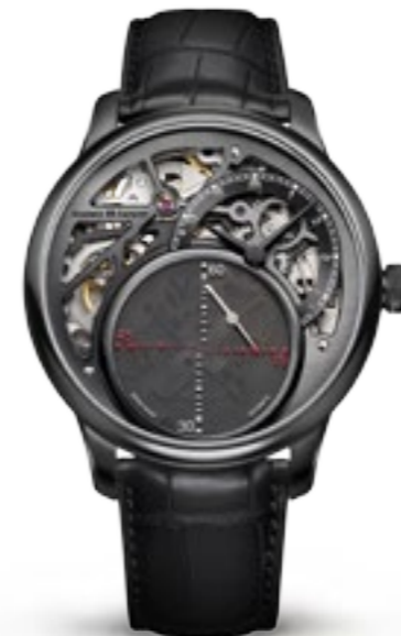
MYSTERIOUS SECONDS REVELATION MP6558-PVB01-092-1

Automatic Manufacture movement ML215 Second revelation mechanism Ø 43 mm black PVD case