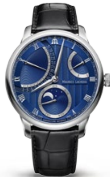
MOON RETROGRADE MP6588-SS001-431-1

Automatic Manufacture movement ML192 Ø 43 mm stainless steel case