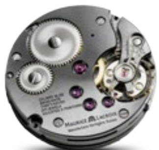
CALIBRE ML 152 MASTERPIECE MOON RETROGRADE