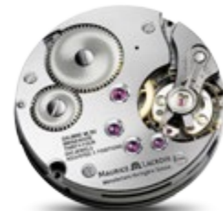
CALIBRE ML 156 MASTERPIECE SQUARE WHEEL