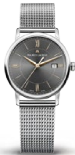
DATE LADIES EL1094-SS002-311-2

Quartz movement Ø 30mm stainless steel case Diamond-set dial