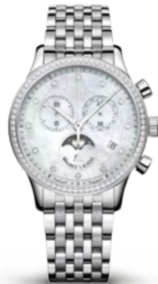
CHRONOGRAPH MOONPHASE LC1087-SD502-160-1

Quartz movement Ø 38 mm stainless steel case with bezel set with 72 diamonds