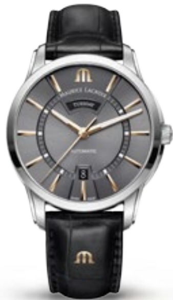
DAY DATE PT6358-SS001-331-1

Automatic movement ML143 Ø 41 mm stainless steel case