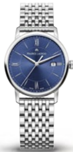
DATE LADIES EL1094-SS002-410-1

Quartz movement Ø 30mm stainless steel case