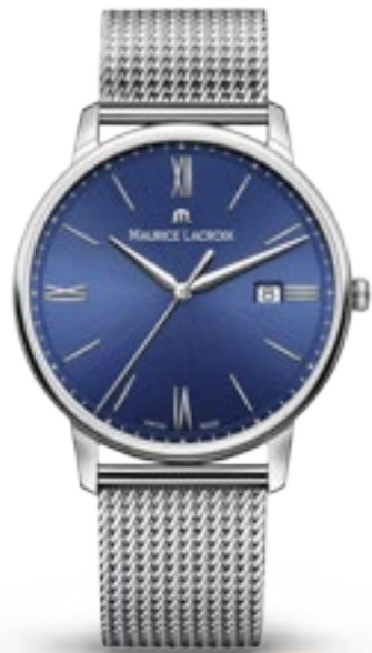
DATE EL1118-SS002-410-1 Quartz movement Ø 40 mm stainless steel case