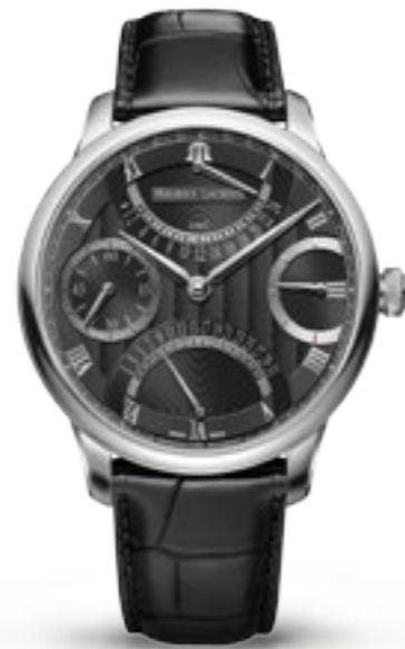
DOUBLE RETROGRADE MP6578-SS001-331-1

Automatic Manufacture movement ML191 Ø 43 mm stainless steel case