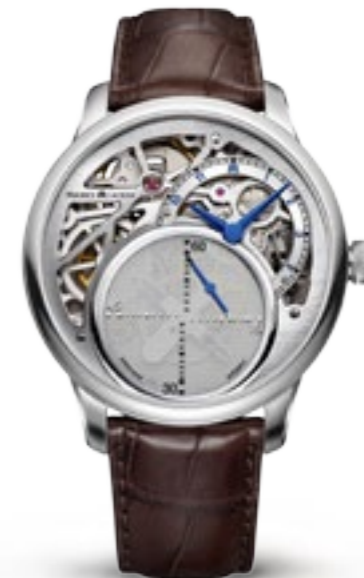
MYSTERIOUS SECONDS REVELATION MP6558-SS001-096-1

Automatic Manufacture movement ML215 Second revelation mechanism Ø 43 mm black PVD case