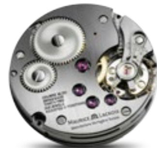
CALIBRE ML 153 MASTERPIECE REGULATOR SQUARE WHEEL