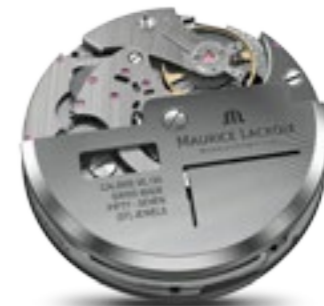
CALIBRE ML 190 MASTERPIECE RETROGRADE CALENDAR