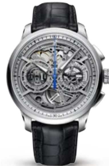
CHRONOGRAPH SKELETON MP6028-SS001-001-1

Automatic movement ML206 Ø 45 mm stainless steel case