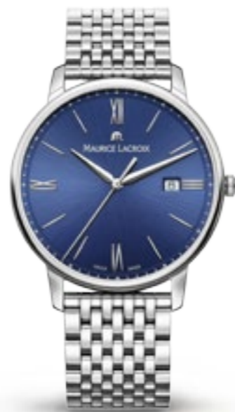
DATE EL1118-SS002-410-2 Quartz movement Ø 40 mm stainless steel case