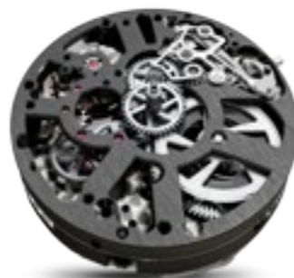
CALIBRE ML 106-7 MASTERPIECE CHRONOGRAPH SKELETON

With numerous awards, patents and designs for new movements and complications, our watches are not just perfect in form but also in function.