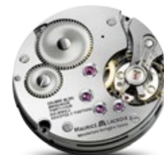
CALIBRE ML 256 MASTERPIECE POWER OF LOVE