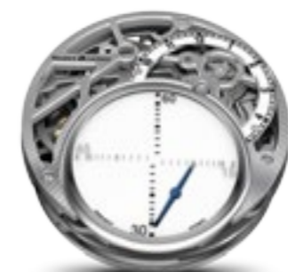
CALIBRE ML 215 MASTERPIECE MYSTERIOUS SECONDS