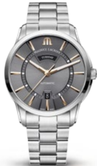
DAY DATE PT6358-SS002-331-1

Automatic movement ML143 Ø 41 mm stainless steel case