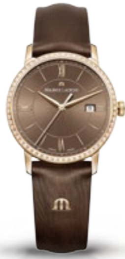
DATE LADIES EL1094-PVPD1-710-1

Quartz movement Ø 30mm 4N PVD case with bezel set with 60 diamonds