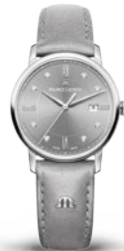
DATE LADIES EL1094-SS001-250-1

Quartz movement Ø 30mm 4N PVD case Diamond-set dial Limited edition of 388 pieces