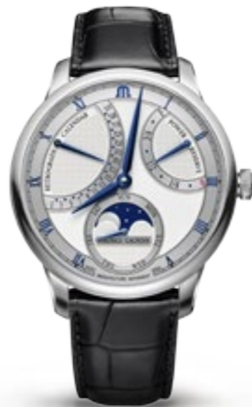
MOON RETROGRADE MP6588-SS001-131-1

Automatic Manufacture movement ML192 Ø 43 mm stainless steel case