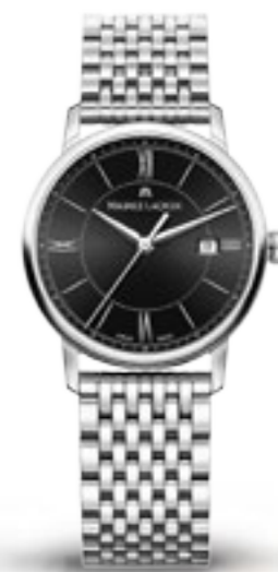
DATE LADIES EL1094-SS002-310-1

Quartz movement Ø 30mm stainless steel case