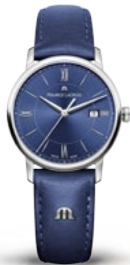
DATE LADIES EL1094-SS001-410-1

Quartz movement Ø 30mm stainless steel case