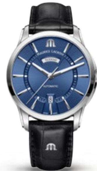
DAY DATE PT6358-SS001-430-1

Automatic movement ML143 Ø 41 mm stainless steel case