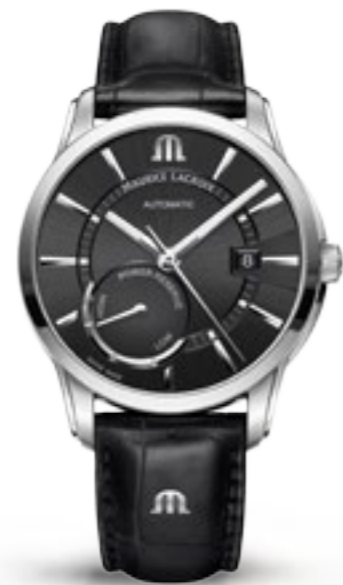
POWER RESERVE PT6368-SS001-330-1

The facility to clearly see the fuel gauge in a car is of vital importance to avoid an inconvenient oversight. Likewise, the same applies to a wristwatch. The ability to see the amount of energy stored within the spring barrel prevents the watch stopping at an inopportune moment.