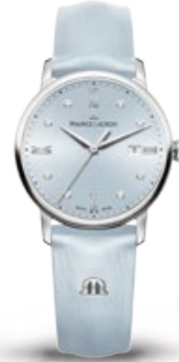
DATE LADIES EL1094-SS001-550-1

Quartz movement Ø 30mm stainless steel case Diamond-set dial