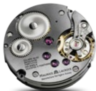
CALIBRE ML 150 MASTERPIECE RETROGRADE CALENDAR