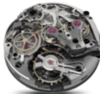
CALIBRE ML 106-2 MASTERPIECE CHRONOGRAPH