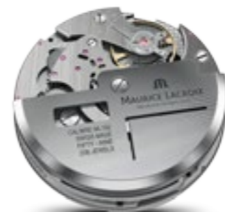
CALIBRE ML 192 MASTERPIECE MOON RETROGRADE