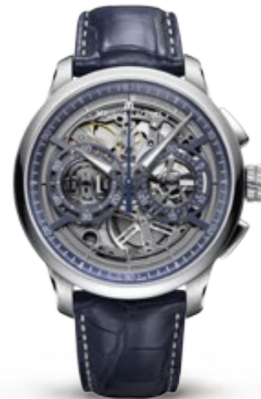
CHRONOGRAPH SKELETON MP6028-SS001-002-1

Automatic movement ML206 Ø 45 mm blue PVD case Limited edition of 100 pieces