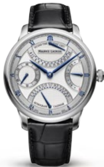
DOUBLE RETROGRADE MP6578-SS001-131-1

Automatic Manufacture movement ML191 Ø 43 mm stainless steel case