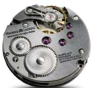
CALIBRE ML 151 MASTERPIECE DOUBLE RETROGRADE