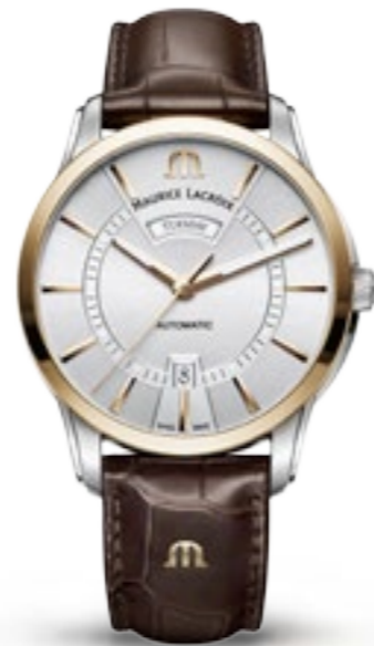
DAY DATE PT6358-PS101-130-1

Automatic movement ML143 Ø 41 mm stainless steel case