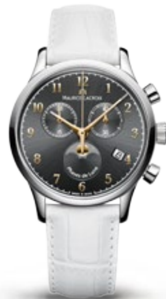
CHRONOGRAPH MOONPHASE LC1087-SS001-821-1

Quartz movement Ø 38 mm stainless steel case