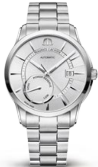
POWER RESERVE PT6368-SS002-130-1

Automatic movement ML113 Ø 41 mm stainless steel case