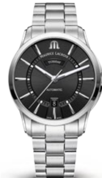
DAY DATE PT6358-SS002-330-1

Automatic movement ML143 Ø 41 mm stainless steel case