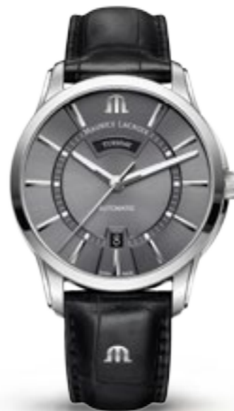
DAY DATE PT6358-SS001-332-1

Automatic movement ML143 Ø 41 mm stainless steel case