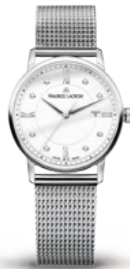
DATE LADIES EL1094-SS002-150-2

Quartz movement Ø 30mm stainless steel case