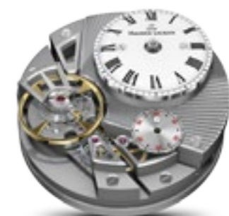
CALIBRE ML 230 MASTERPIECE GRAVITY