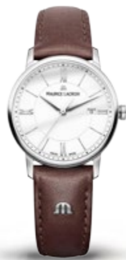
DATE LADIES EL1094-SS001-110-1

Quartz movement Ø 30mm 4N PVD case with bezel set with 60 diamonds