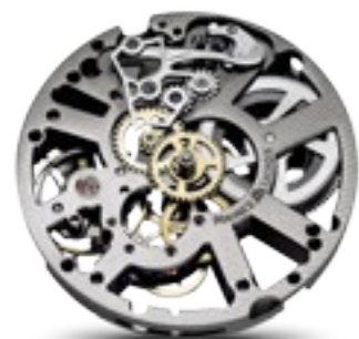
CALIBRE ML 134 MASTERPIECE SKELETON