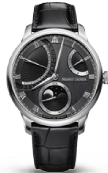
MOON RETROGRADE MP6588-SS001-331-1

Automatic Manufacture movement ML192 Ø 43 mm stainless steel case