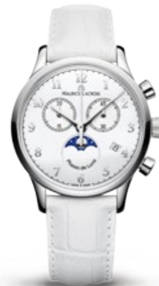
CHRONOGRAPH MOONPHASE LC1087-SS001-120-1

Quartz movement Ø 38 mm stainless steel case with bezel set with 72 diamonds