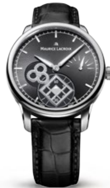
SQUARE WHEEL MP7158-SS001-301-1

Hand-wound Manufacture movement ML156 Ø 43 mm stainless steel case