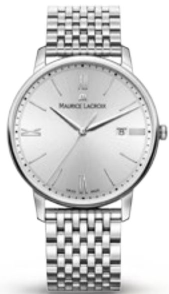
DATE EL1118-SS002-110-2 Quartz movement Ø 40 mm stainless steel case