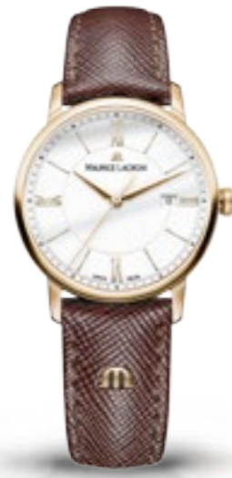
DATE LADIES EL1094-PVP01-111-1

Quartz movement Ø 30mm stainless steel case