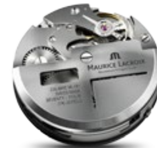
CALIBRE ML 191 MASTERPIECE DOUBLE RETROGRADE