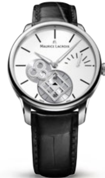
SQUARE WHEEL MP7158-SS001-101-1

Hand-wound Manufacture movement ML156 Ø 43 mm stainless steel case