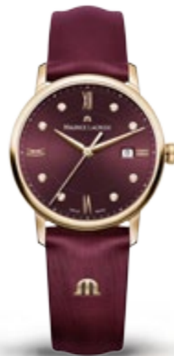
DATE LADIES EL1094-PVP01-550-1

Quartz movement Ø 30mm 4N PVD case Diamond-set dial Limited edition of 388 pieces